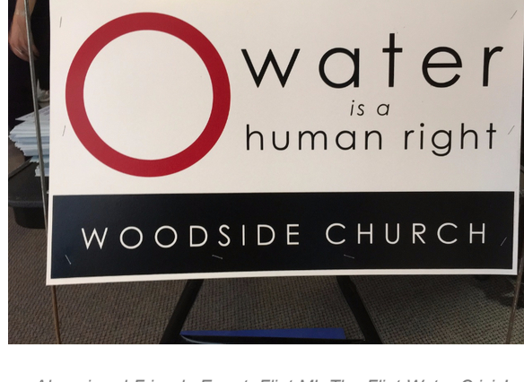
Alumni and Friends Event, Flint MI. The Flint Water Crisis!